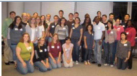
2011 Annual Student Retreat Attendees

As people arrived on Friday evening, we played games and got acquainted. On Saturday morning we held a benefit walk to raise support for the Free Medical Clinic in Winchester, VA. This clinic has been providing health care to poor and uninsured patients for 25 years. We were able to raise $1000 (continued page 3)