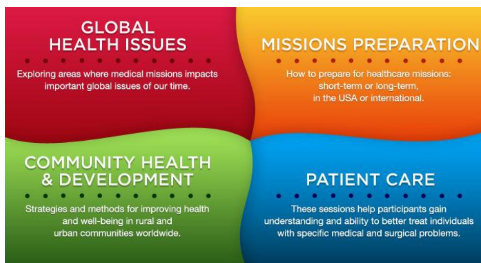
Figure 1 Areas of focus for the Global Missions Health Conference

In addition to the large general sessions, there were over 100 workshops dealing with various aspects of global health and medical missions. Content in the workshops were focused in 4 different areas. (Figure 1) These are extremely valuable seminars and presentations for anyone interest in medical missions or engaged in global health issues.