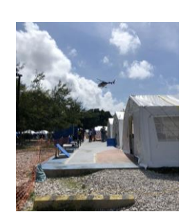
Haiti Tier I EFH Hospital wards and helicopter transport