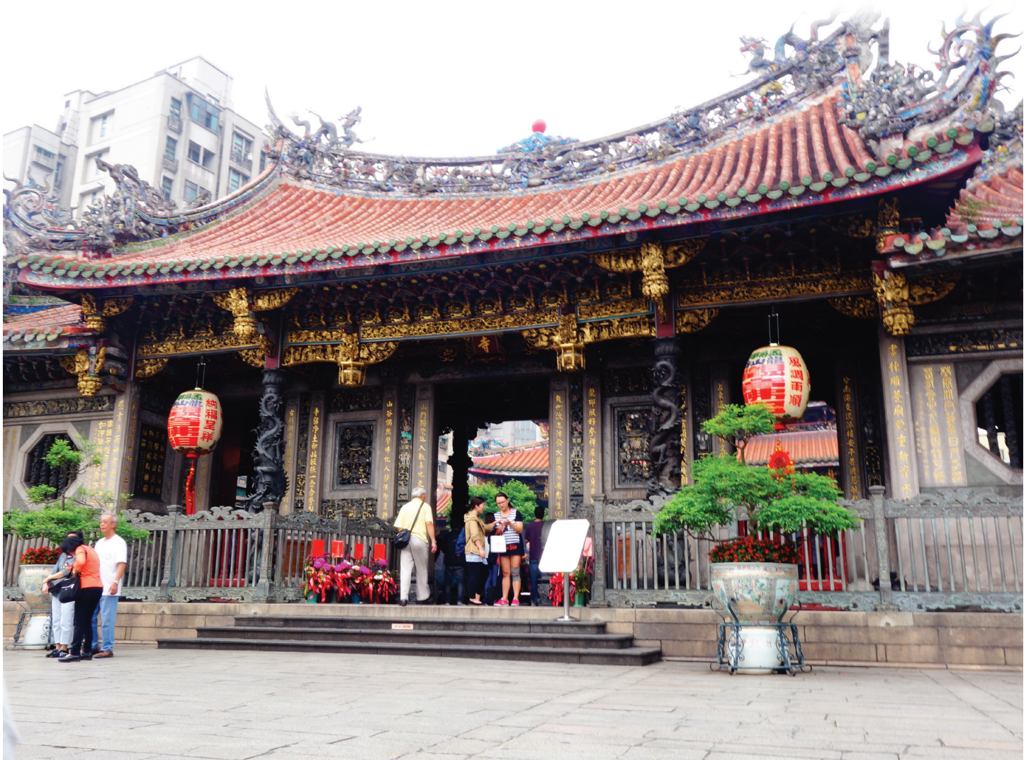
Longshan Temple, located in Wanhua, the oldest neighborhood in Taipei, is the spiritual heart of the city, representing the ancient history of the region.