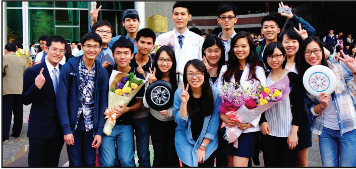
Student members of the Bible Study Club at Taipei Medical University, representing the various schools on campus.

the associate director and area managers. These Christian pharmacy leaders understand that they are merely tools in the hands of God. It is the Lord Who causes all things to work together for the good of those who love Him. Two of the Wanfang pharmacy managers became believers during their short term clinical training in the U.S. – one in Iowa and one in Los Angeles. Through the coordination and intercession of shepherds at Wanfang Hospital and in the U.S., they accepted Jesus in baptism and have continued to grow in faith and church life since returning to Taipei.