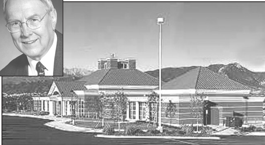
Dr. James Dobson, founder of Focus on the Family, located in Colorado Springs, Colorado.