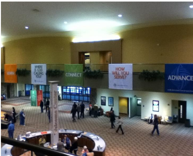
2012 Global Missions Health Conference Southeast Christian Church Louisville, KY