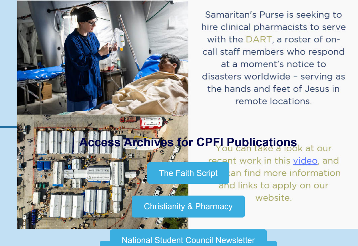
Samamans Fuise - Leann More & Apply